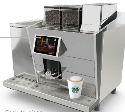
Easy-to-clean, premium look