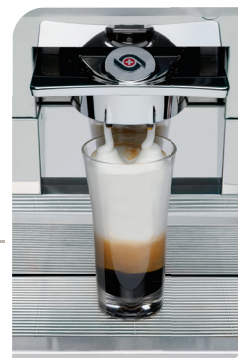
Automatic foamed milk