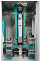
Calibration and finish endless belt sanding aggregate BA300

Programmable and motorized aggregate positioning, spring loaded top pressure roller system and centralized side stop set-up result in fast and easy profile changes.