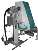
RB300 aggregate with motorized height setting and oscillation