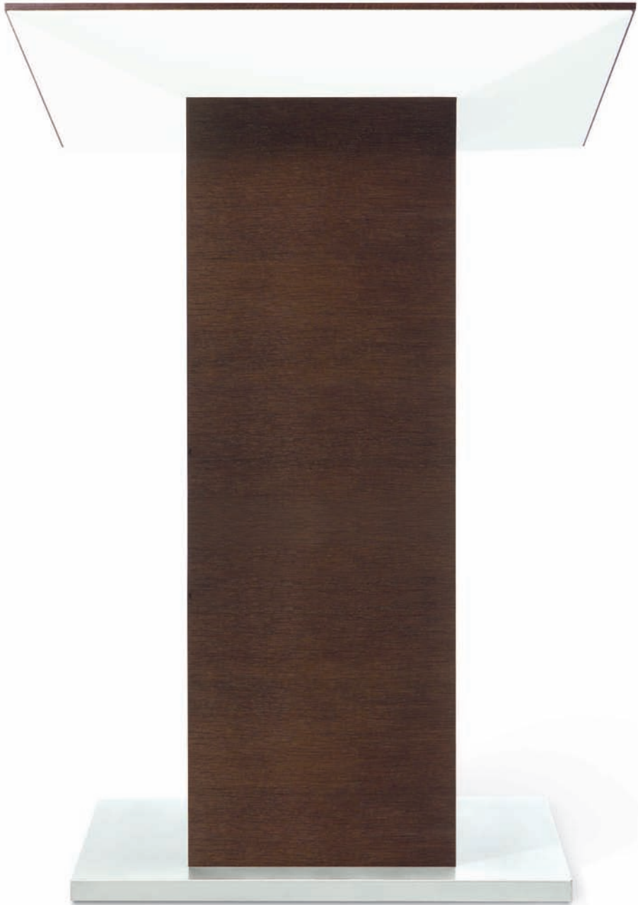
AERO LECTERN | The LECTERN features table details including angular sub-top, pedestal and accent base.